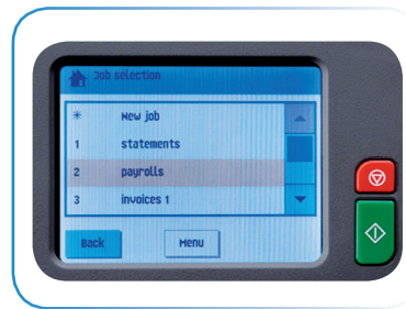
User-friendly full-color touchscreen control panel

* Paper & envelope specifications may vary. All media must be tested.