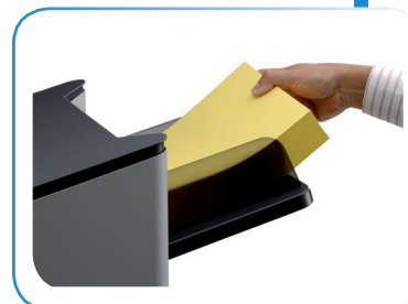
High-capacity Document Feeder holds up to 725 sheets and multi-page sets