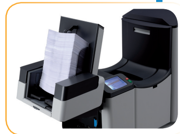
High-capacity Vertical Stacker holds up to 500 filled envelopes