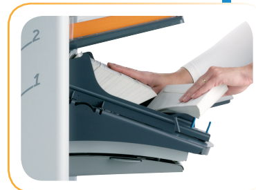
Optional Production Feeder holds up to 325 BREs

Formax - New Hampshire, USA www.formax.com