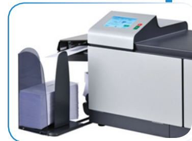
Optional side exit tray