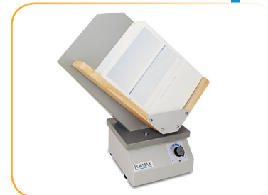
402 Series Jogger - option reduces static electricity from forms and aligns them for proper feeding

Formax - New Hampshire, USA www.formax.com