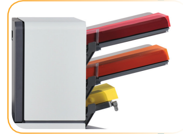
2 sheet feeders and 1 insert/BRE feeder