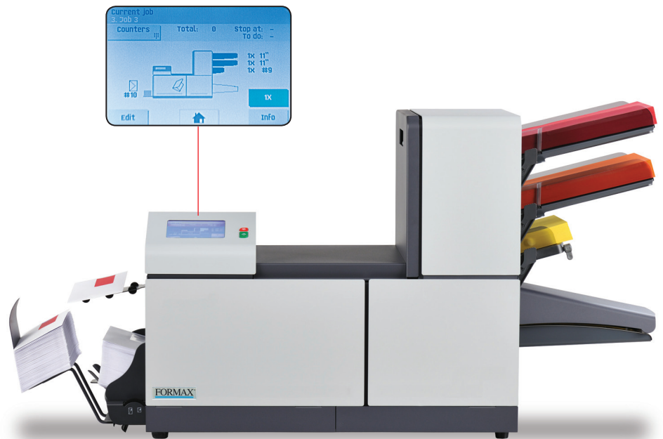
FD 6204-Advanced 2