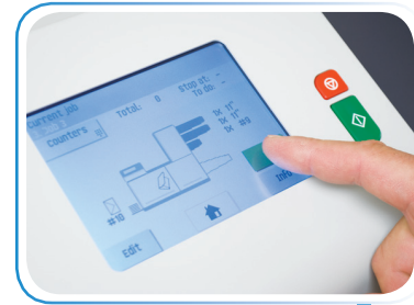
User-friendly color touchscreen control panel

* Paper & envelope specifications may vary. All media must be tested.