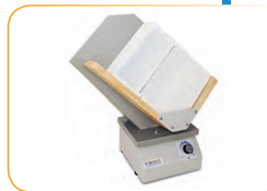
402 Series Jogger - option reduces static electricity from forms and aligns them for proper feeding

The FD 6102 is designed for anyone to use. The large, clearly marked color touch screen display panel gives step-by-step prompts and guidance. To make operation even easier, up to fifteen frequent and recurring jobs can be programmed for access with the touch of a button. A user friendly drop-in feed system and clamshell design for easy access to the paper path add to the simplicity of operation.