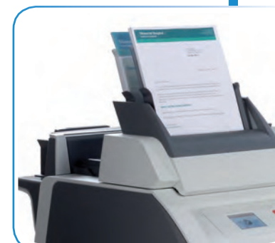
2 Sheet feeders and 1 insert/BRE feeder

Automation saves time, money and reduces the amount of handling, making the document more secure. To ensure the integrity of mailings, the FD 6102 has true double document detection which prevents double feeding. This electromechanical system is not sensitive to paper dust or colored paper, ensuring the right document goes to the correct recipient.