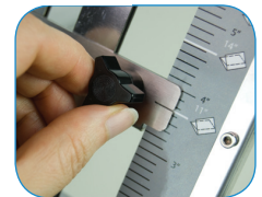
Clearly marked fold plates for quick and easy setup

The FD 314 Office Desktop Folder provides user-friendly controls in a rugged, compact unit. Clearly-marked fold settings and push-button operation make it easy to use, right out of the box. It's capable of folding 11" and 14" paper at speeds up to 7,700 sheets per hour, with a hopper capacity of up to 250 sheets.