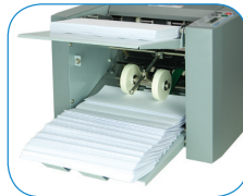
Output conveyor for neat & sequential stacking