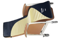
Geo-Wave® Specialty Chair Cushion

Note: This algorithm is meant as a guide, and is not a substitute for clinical judgment. Regardless of product selection, a full assessment of skin status and repositioning is required according to best clinical practice.