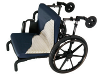
Short Wave® Seat and Back Cushion

Seat/Back Combination Products for Prevention with Positioning LOW to MODERATE risk