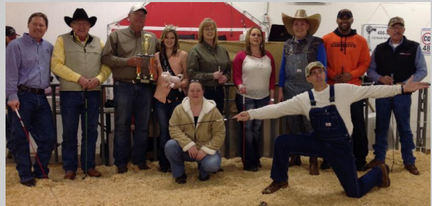
Participants in last years Celebrity Livestock Show

For more information, please contact our office at 918/486-2513.