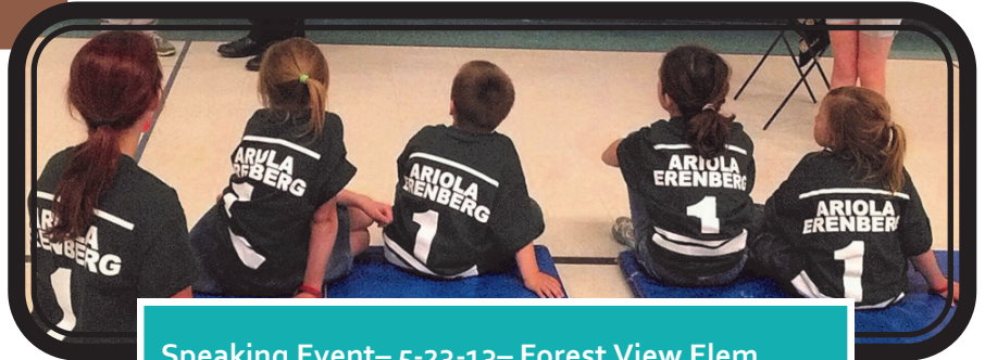
Speaking Event— 5-23-13— Forest View Elem