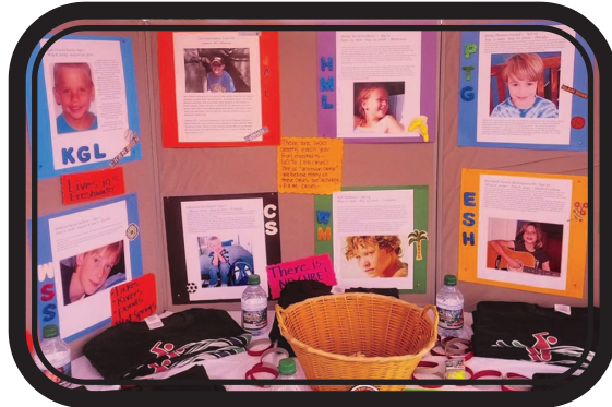
Hillbilly Hoedown—Coon Lake— 6-1-13