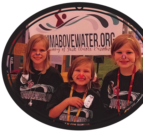
Lake Fest— Forest Lake, MN 6-1-13